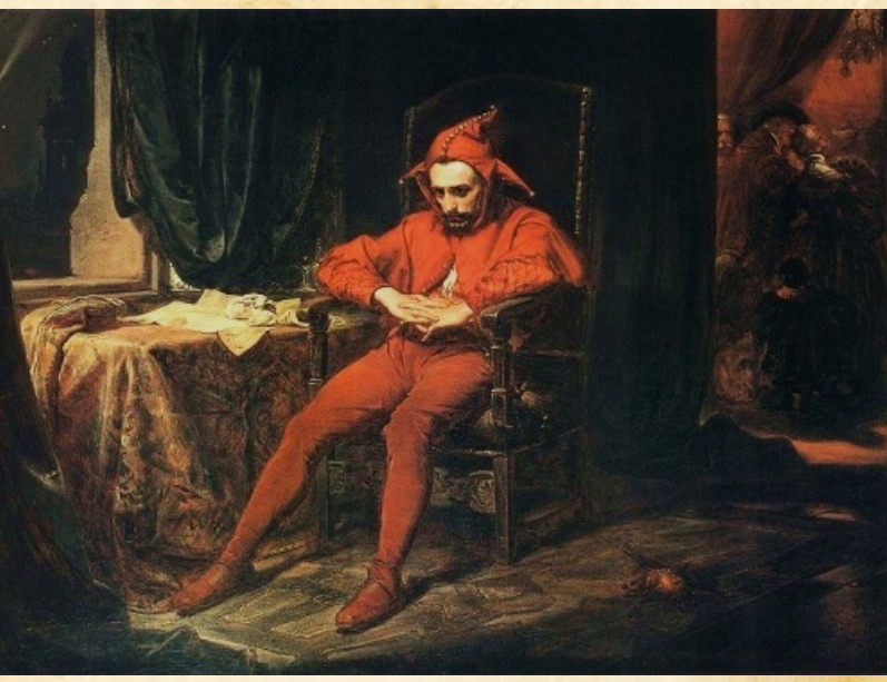
Stańczyk , Jan Matejko (1862)

Some of the main visual references we worked with were classic and historical paintings.