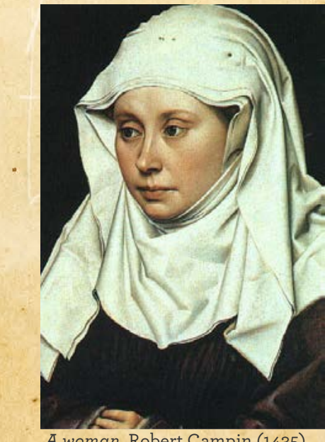
A woman, Robert Campin (1435)